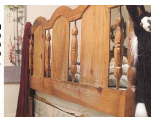
Mold growing on a wooden headboard in a room with high humidity.

Currently there are no national standards for regulating concentrations of specific molds, degrees of exposure, or methods of abatement which would determine a specific hazardous condition. Neither is there definitive scientific evidence that a specific exposure to a measured concentration of a particular mold would have an adverse health effects on a particular group of people. If suspect concentrations are noted your physician should be consulted.